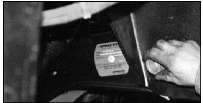
Figure 6b. ID tag on early INTRAAX suspensions