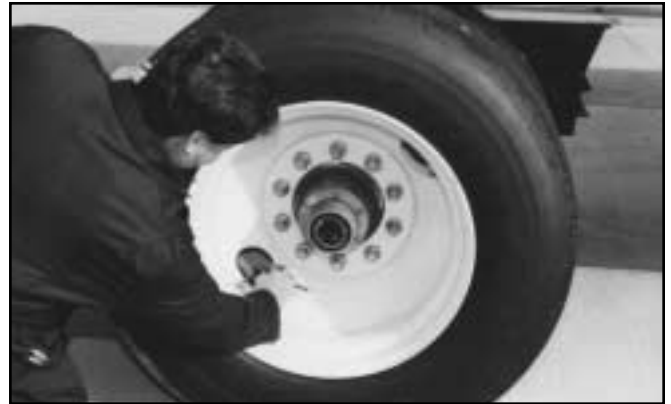
Figure 2. Check air pressure in tires