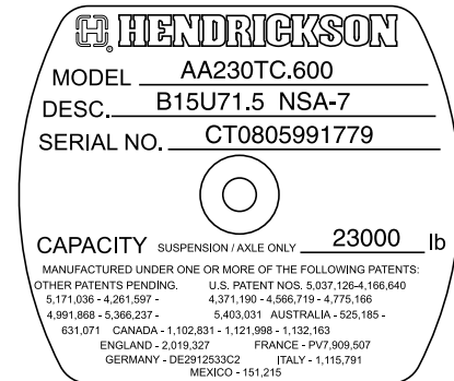
Figure 6c. ID tag on current INTRAAX suspensions