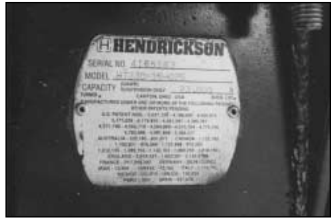
Figure 6a. ID tag on HT series suspensions

NOTE: To determine the ride height, add half of the diameter to the measurement shown on the tape measure. For example, a 5-inch diameter axle would have 2½ inches added to the measurement.