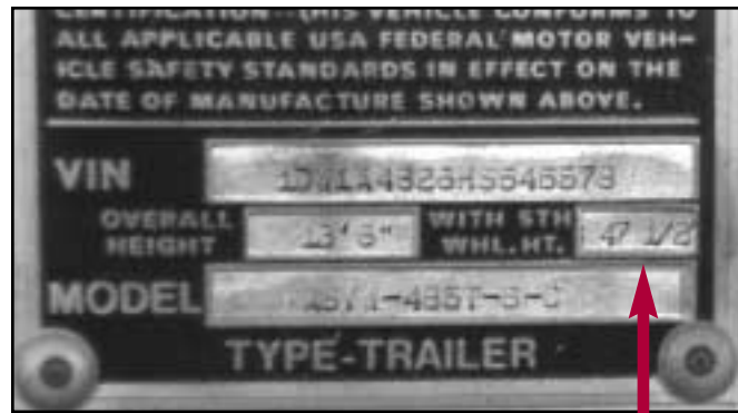
Figure 4. Check ID tag