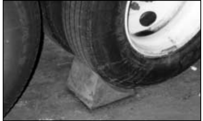
Figure 1. Chock the wheels