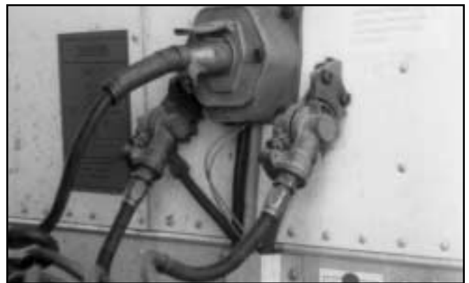
Figure 3. Maintain air pressure to suspension