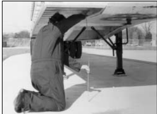
Figure 5. Measure from ground to kingpin